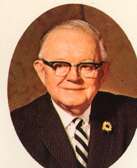
J. Millard Tawes, Governor of Maryland